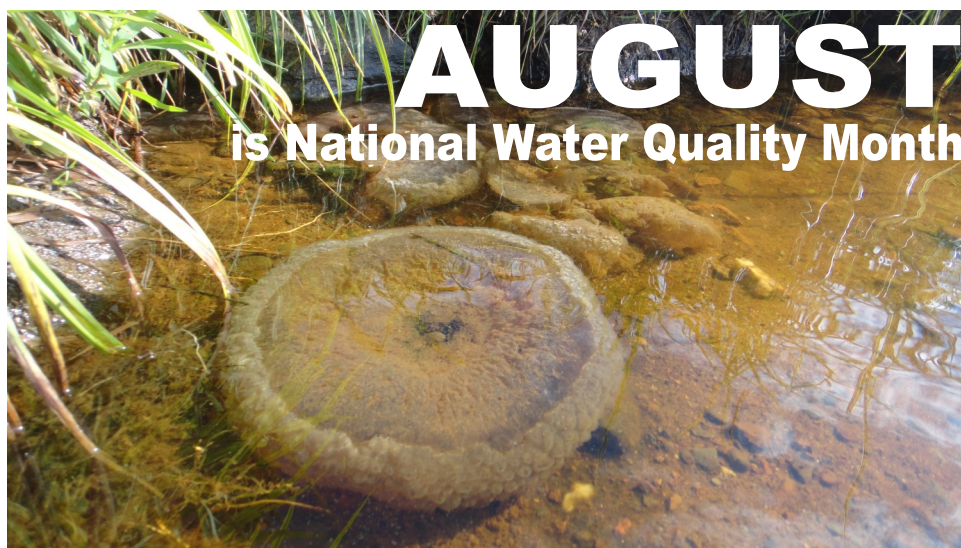
Bryozoan - West Twin Lake, Fond du Lac Band of Lake Superior Chippewa; Their presence is often an indicator of clean, healthy water.