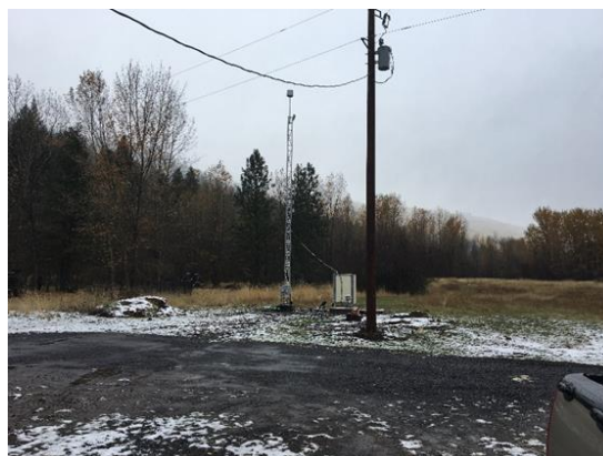
CTUIR CastNet site in full operation with fresh snow on the ground.

With the COVID-19 pandemic in the background, CTUIR coordinated with the EPA CASTNET Team and the CASTNET contractor, Wood Environment & Infrastructure Solutions, Inc. CTUIR also worked with the National Atmospheric Deposition Program (NADP) to include passive ammonia measurements as part of the Ammonia Monitoring Network (AMoN). Crucial planning calls between CTUIR, the Region 10 Project Officers, and EPA HQ took place to establish a funding mechanism. CTUIR's funds from the Regional Multi-Purpose Grant (MPG) were utilized to cover capital costs (equipment and site infrastructure) and regional STAG funds will be allocated for annual operating costs.