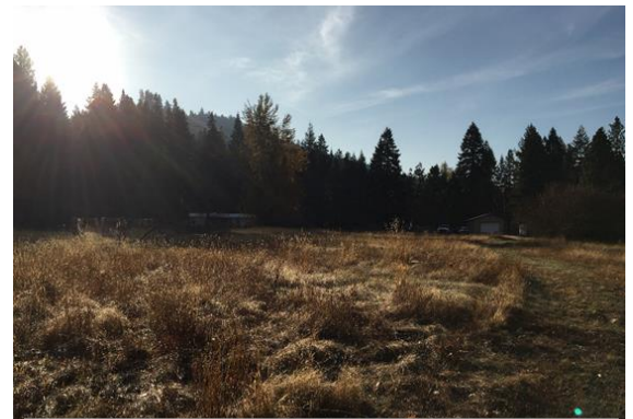
CastNet site groundbreaking day. Site is on right side of photo before construction began in early September 2020.

For CTUIR CASTNET site information, access the CTUIR's CASTNET site page and for the AMoN site visit the NADP website .