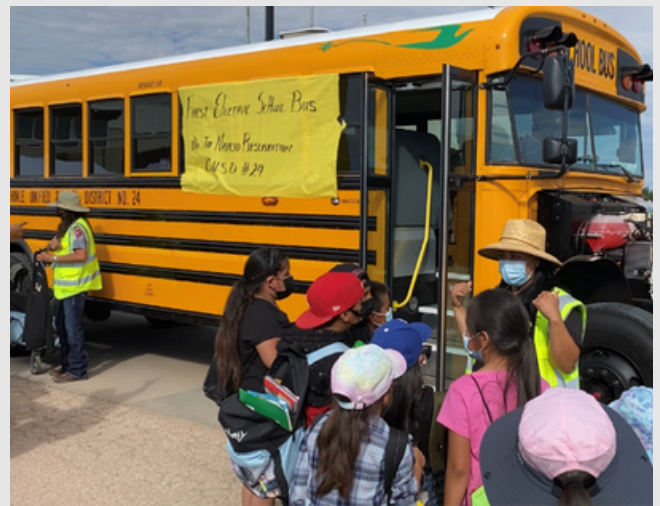
Blue Bird delivered its first electric school bus to Chinle Unified School District in Arizona.

In early 2023, The Institute for Tribal Environmental Professionals (ITEP) developed and introduced a new initiative called the Tribal Clean Transportation Program (TCTP). The goal of the new program is to help Tribal communities navigate and lead this important transition happening across the nation. One of the program's initial activities was to host a series of listening sessions through a collaboration with the National Renewable Energy Laboratory (NREL). Read this Native Science Report article that featured the TCTP!