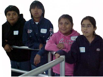
Shonto Preparatory Middle School Students