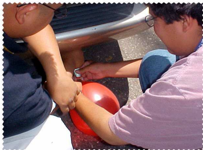
A Shonto student collecting a sample of car exhaust to be tested for carbon dioxide concentration.

allowing them to develop the skills needed for future success. Students are encouraged to consider college options following completion of high school. Students also build mentoring relationships with the college students who serve as assistant instructors during the various activities.