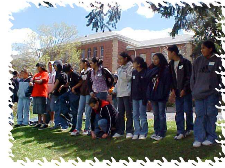
Students during a Saturday Academy session

These programs are funded through a cost sharing partnership with participating schools and the Institute for Tribal Environmental Professionals (ITEP), who is funded in part by the U.S. Environmental Protection Agency (EPA). Cost estimates are available upon request.