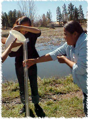
Testing water turbidity at Flagstaff Middle School Pond

The Saturday Academy program provides students from the Navajo Nation an on-campus pre-college experience. Saturday Academy goals include teaching students how to apply mathematics, science, and technology to local environmental issues, helping students learn about college preparation and admissions and