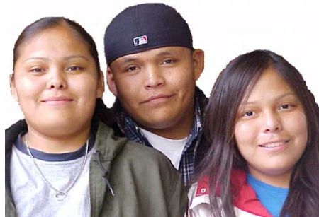
Students during a campus visit

Shonto Middle School Students during a Saturday Academy session