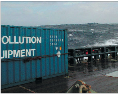
High seas conditions can make vessel operation hazardous.

increased risk when operating offshore and, where possible, regular local workers acting as safety escorts should accompany them. A personal floatation device must be worn by all responders working offshore and in vessels, because swimming ability is impaired by clothing such as boots and helmets. Vessels engaged in offshore response work should be suitably sized and equipped to deal with the environment. Adequate and suitable safety and communications equipment should be installed on the vessels. Crews should be trained and competent in the operation of the vessels and responders should be trained and fully briefed on their responsibilities.