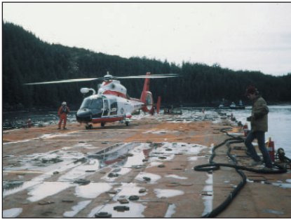
Aircraft can play a significant role in response operations.