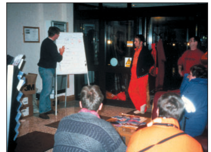
Briefing the response team prior to a day's operations