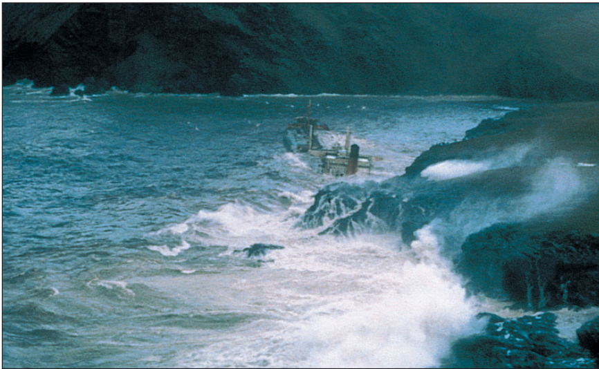
The natural environment can present a significant risk.

Although indigenous flora and fauna are often an important ecological and environmental resource, they can present a very real safety issue. Poisonous plants and dangerous animals need to be identified, and their appearance publicized to the responders along with information on how to deal with the threat they present. Of greater concern are those creatures that may actually attack humans both in the sea and on dry land. Where these possibilities exist, expert advice must be obtained and adequate protection provided.