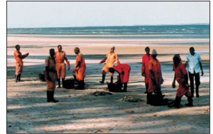
A properly equipped, well motivated team is a major asset

The working environment will often dictate the PPE selection criteria. For example, cold weather environments require the use of thermally insulating clothing. This type of clothing can be rendered unusable if it comes into contact with liquid oils, hence a robust and well-sealed impermeable layer should be worn above the cold weather clothing. Conversely, in hot climates, impermeable clothing will exacerbate the problem of heat stroke. Workers should therefore be given adequate rest breaks and liquids to ensure their welfare, or an acceptable compromise should be reached in the type of PPE that they wear.