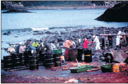
Volunteer activities must be coordinated and the safety aspects managed.