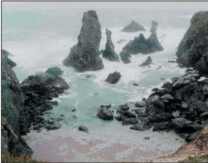
Oil spills invariably bring out the worst in the weather.