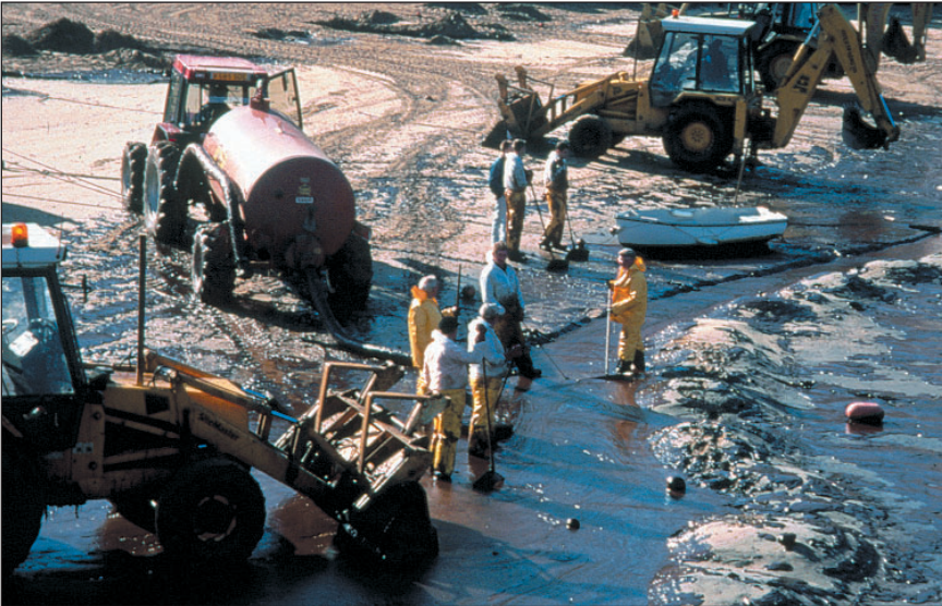
Shoreline clean-up operations need to be managed carefully to prevent accidents.

It is essential that shoreline responders are trained to recognize the hazards present in their working environment, and are provided with adequate means to control the risks.