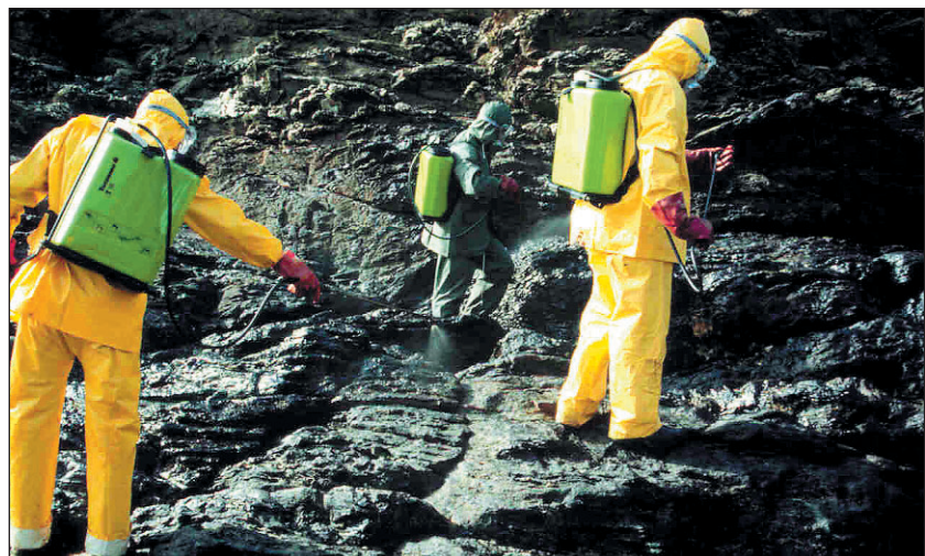
Appropriate PPE must be used when using dispersants.