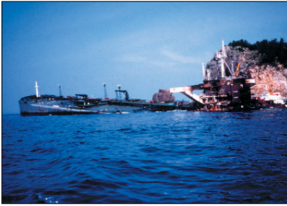
An overall risk assessment should be conducted at the start of a spill.