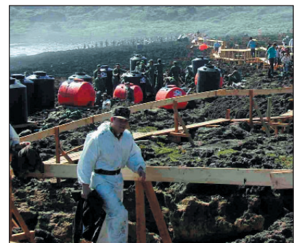
Providing safe access to the worksite is critical to reducing the risk of accidents.

As mentioned previously, the most common hazard to responders is the danger from slips, trips or falls. Oil spills can occur in locations where the access to the work site is difficult. The problem is compounded when the surface is coated with oil, but rocky shorelines can be naturally slippery due to seaweed, wet rocks or mud. Safe and secure access must be provided for the workforce to prevent the possibility of injury. When working on the shoreline, it is advisable for responders to keep clear of cliffs or rocky shorelines until a safe means of access has been provided, either in the form of access bridges or guide ropes. Clean-up crews should be warned of the hazards of any particular site access and be given