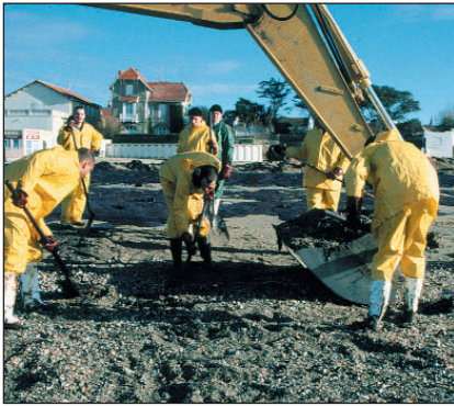
Shoreline deployments require extensive management (see box below).

The extent and potential threat of these hazards must be taken into account before committing responders to any particular activity. If there is a risk, suitable and appropriate countermeasures and plans should be established, communicated and tested.