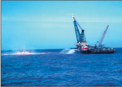
Some spills present specific safety risks

Responses to oil spills inevitably put responders and chemicals together in the same environment. Potential exposure of personnel should be assessed, monitored, and controlled if health effects are to be avoided. Each type of product, when spilled into the environment, will have its own set of chemical characteristics that will determine the most effective response strategy and, indeed, which strategies are safe to use. It should be borne in mind that the chemical characteristics of the spilled product will usually change over a period of time as a result of what is known as ‘the weathering process’, i.e. the action of the elements on the product and its reaction with the surroundings.