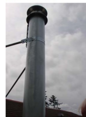
Woodstove stack after change out.