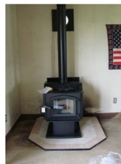
Woodstove after change out.