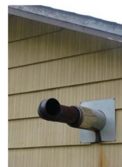
Woodstove stack prior to change out.