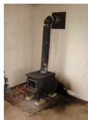
Woodstove prior to change out.

Images (below) from the Makah Tribe's Woodstove Change-out Report