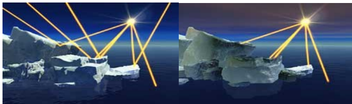
Image depicts normal albedo (left) and reduced albedo due to black carbon deposition (right); Photo courtesy of NASA Goddard Institute for Space Studies.

atmosphere, black carbon raises atmospheric temperatures by directly absorbing solar radiation. Once deposited on snow and ice, black carbon reduces the reflectivity, or albedo , of that surface by absorbing more sunlight and therefore changes the earth's energy balance. This process accelerates the rate of snow and ice melt and creates a positive (or self-perpetuating)