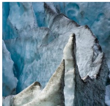
All photos and graphics provided courtesy of the US Environmental Protection Agency.

http://www4.nau.edu/tribalclimatechange/index.asp .