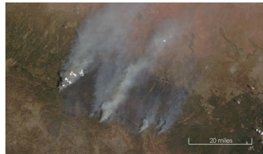
Satellite image of the 2002 Rodeo-Chediski fire (above) and the 2011 Wallow fire (below).

Yet another concern with warming temperatures and wildfire is the potential for invasive insect colonization and native insect outbreaks [4] . Although insects are a part of the natural forest landscape, they are also highly adept at capitalizing on degraded forest environments. Indeed, the U.S. Forest Service states unequivocally that “the recent large-scale dieback of piñon and ponderosa pine and associated bark beetle outbreaks in the Southwestern United States has been linked to the ‘climate change type drought’ [6] .”