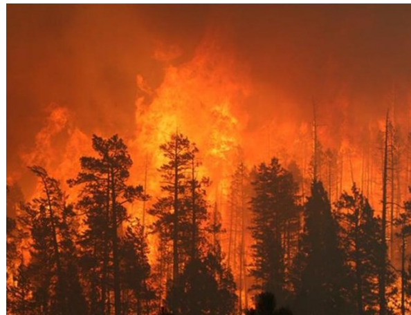
Wallow fire, 2011