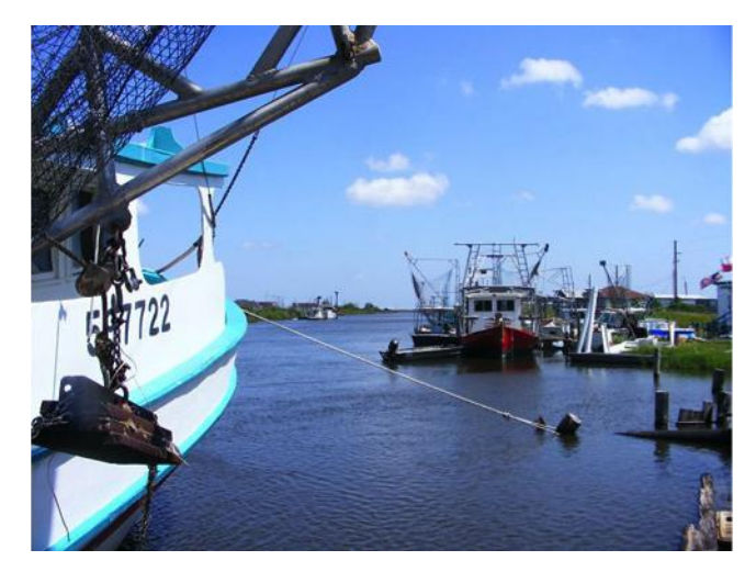
Grand Bayou Village.

Grand Bayou Village is a water-based tribal community located in Plaquemines Parish, LA. The Tribe has inhabited this village for 300 years, and the broader region for much longer. They are primarily Atakapa-Ishak, with