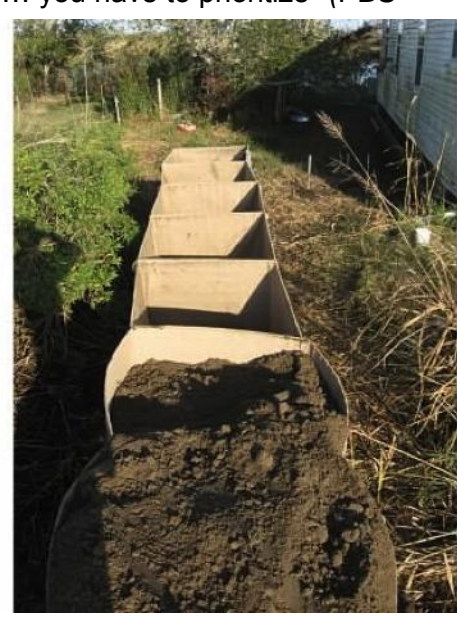
Building raised bed gardens to act as surge protection for the homes at Grand Bayou.

The NRCS Workshop concluded that there is a need for information on changes to species and ecosystems, and adaptation strategies to protect and foster cultural resources in changing conditions. The workshop resulted in a long list of actions that tribes could implement to adapt to climate change and environmental impacts. These include bulk