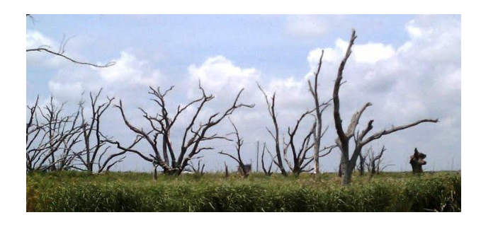
One of many "ghost forests" - dead trees that were not able to adapt to invading salt water. Image: http://bayoureference.blogspot.com/2011/06/flood-control-vs-coastal-erosion.html

lack of vegetation allows regular tides and storms