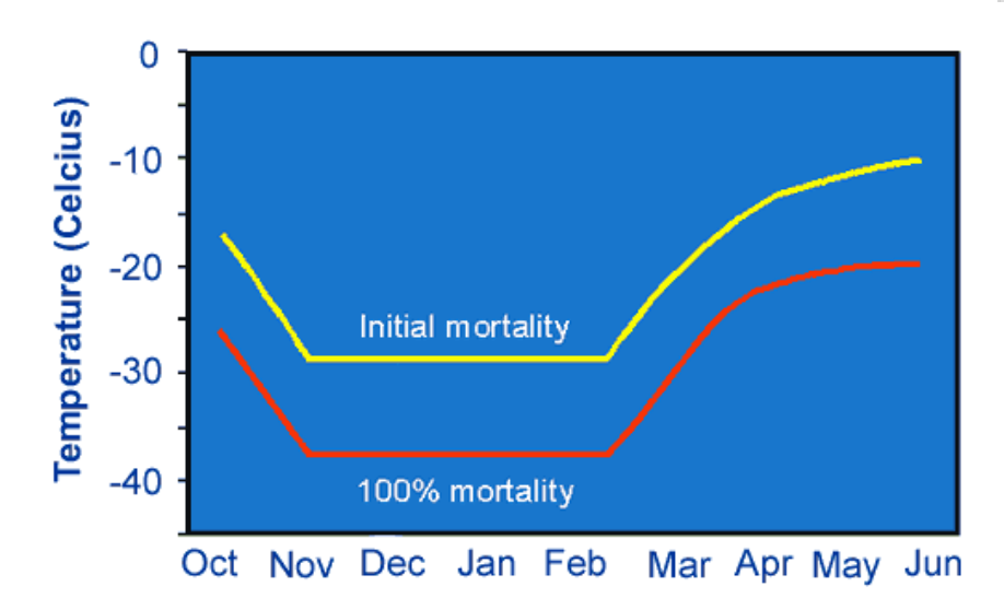
Figure 2. Average beetle mortality thresholds as a function of season. The upper line indicates the minimum temperature at which beetle larvae begin to die. When under bark temperatures reach the threshold indicated by the lower line 100 percent mortality occurs. (from Canadian Forest Service, Natural Resources Canada)