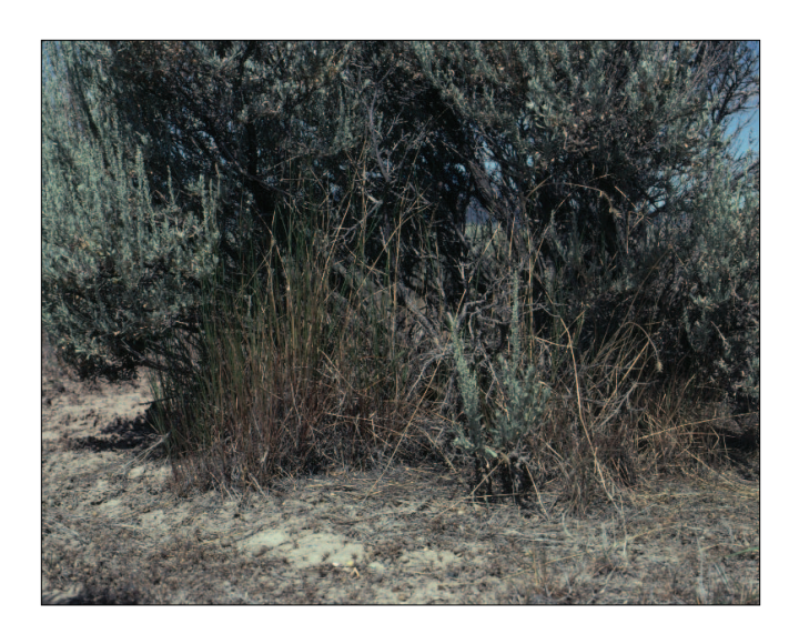
Figure 1 —A photo of a site where the only grass present is under the protective canopy of mature big sagebrush ( Artemisia tridentata ) plants.

Daubenmire (1975, p. 31) states: "Field observations in Washington indicate that not only is there no allelopathic influence from this species of Artemisia... but that it has a beneficial effect on other plants." Wight and others (1992) describe one of these "beneficial effects on other plants" as being in the area of water conservation and extending water near the soil surface by 2 weeks versus interspaces between plants (see also Chambers 2001). They noted that big sagebrush canopies reduce solar radiation and prolong the period favorable for seedling establishment for perhaps as long as 28 days (also see Pierson and Wight 1991; and Chambers 2001 for favorable soil temperatures under big sagebrush). Hazlett and Hoffman (1975) studied the pattern of plant species placement in relation to big sagebrush distribution in western North Dakota. Their study site was dominated by big sagebrush that had a canopy cover value of 29 percent. They counted the number of established plants found in three concentric zones under and beyond the individual big sagebrush plant canopies. Number of established plants (most forbs, 18 species) in the inner zone