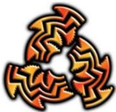
Morongo Band of Mission Indians