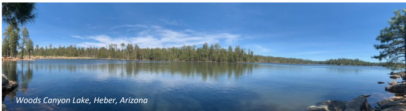
Woods Canyon Lake, Heber, Arizona

The tribal consultation notification letter and consultation and coordination plan are available via EPA’s Tribal Consultation Opportunities Tracking System (TCOTS) website located at: https://tcots.epa.gov .