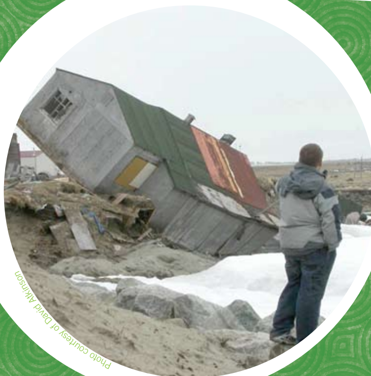
Coastal erosion in Shishmaref, Alaska

With scientific experts now predicting that the effects of climate change will be more severe and appear even faster than previously believed, it comes with little surprise that participants in the Summit from every world region shared observations and experiences of early impacts in their part of the planet. Climate change is not just a theory to us; it is a stark and dangerous reality.