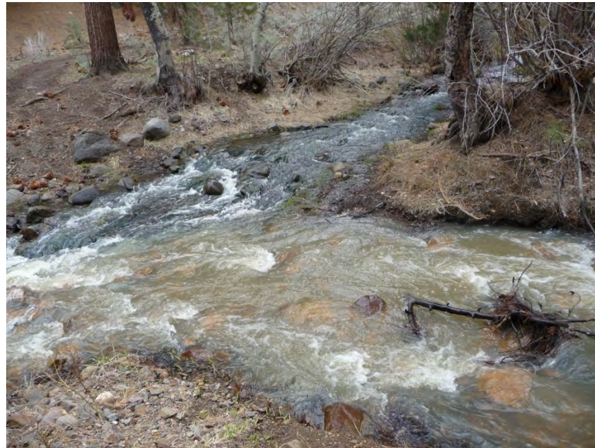
Leviathan Creek and clean tributary