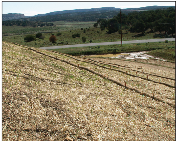
Ongoing revegetation in Step Out Area 1