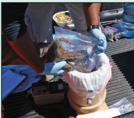
Soil testing in East Drainage

Last spring, UNC/GE investigated the drainage area from the NECR Mine site East of Red Water Pond Road and found additional contamination from the mine site run-off. In June, UNC/GE fenced this area to prevent grazing or other potential exposures. The East Drainage area is now referred to as "Step Out Area #2" (See Figure 1, Area D) as the Step Out Area #1 (See Figure 1, Area C) was the focus of the 2009/2010 clean up action. Step Out Area #2 is addressed in a separate action plan and will be cleaned up in 2012 with voluntary housing options for the affected residents. This waste will be moved onto the NECR Mine site temporarily until the larger mine site clean up discussed in this Fact Sheet planned in 2014.