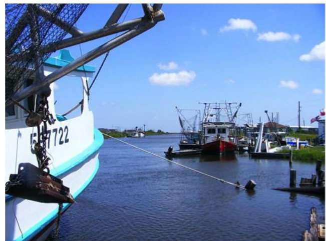
Grand Bayou Village.

Grand Bayou Village is a water-based tribal community located in Plaquemines Parish, LA. The Tribe has inhabited this village for 300 years, and the broader region for much longer. They are primarily Atakapa-Ishak, with