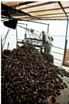
Oil suffocates traditional food sources such as black oysters, threatening food security of tribal communities.

Not only are declining environmental protections such as substantial land mass or living trees creating vulnerability; the lack of government response when disaster strikes increases the vulnerability of coastal Louisiana tribes. While national and international concern focused on the destruction of the city of New Orleans during Hurricane Katrina, coastal Louisiana tribes were fighting their own battle (Archambeault 2006). Tribal communities lost boats, homes, and livelihoods to the mud and floodwater that washed over the area during severe storms. In addition, the hurricanes caused the loss of many coastal wetlands, and devastated the