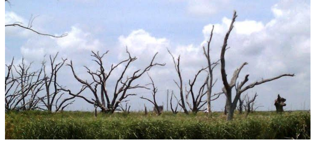
One of many “ghost forests” - dead trees that were not able to adapt to invading salt water.

ceased because there are no longer muskrats near their homes. Other communities, such as Isle de Jean Charles, are concerned because many of their traditional medicinal plants no longer can survive the increasing saltwater intrusion. Bethel et al. explains, “the new inlets and expanded waterways allowed increasing tidal exchange and greater salinity fluctuations, which created a stressful habitat for historical vegetation that was less tolerant of these conditions” (567). These conditions further contribute to land loss and erosion because the lack of vegetation allows regular tides and storms to more easily erode existing marshland, creating a positive feedback loop of deterioration and land change. Additionally, tropical storms (such as Lee in 2011) wreak havoc on the fragile and quickly disappearing gardens and vegetation (NRCS Workshop 2012, 13).