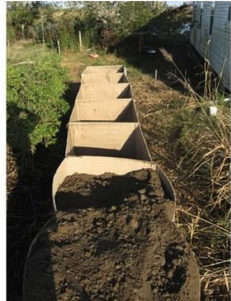
Building raised bed gardens to act as surge protection for the homes at Grand Bayou.

The NRCS Workshop concluded that there is a need for information on changes to species and ecosystems, and adaptation strategies to protect and foster cultural resources in changing conditions. The workshop resulted in a long list of actions that tribes could implement to adapt to climate change and environmental impacts. These include bulk heading for protection and land erosion, fostering self-sufficiency and coordination with other coastal communities, creating raised-bed gardens, ensuring that their input is considered when