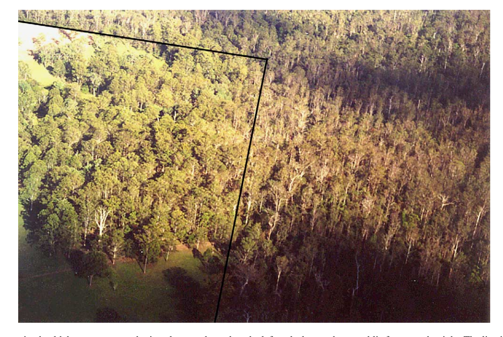
Fig. 1. Contrasting health between a grazed privately owned stand on the left and a long unburnt public forest on the right. The line indicates the cadastral boundary.

The age of declining trees ranges from decades to centuries, but saplings in declining stands are usually healthy compared to poles or mature trees in the same stands. Saplings of E. sieberi were unaffected when mature trees were killed by a rising water table (Jurskis and Turner, 2002). In declining stands of E.